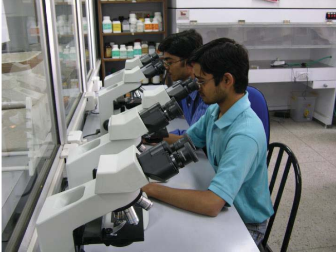
M.Sc. (Genetics) laboratory facility