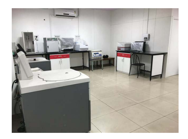
Microarray Hybridization Chamber