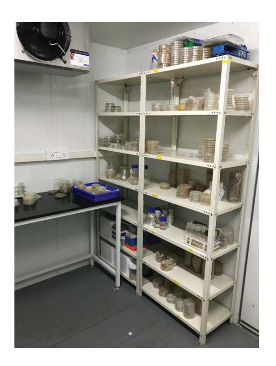
Cold Room Facility