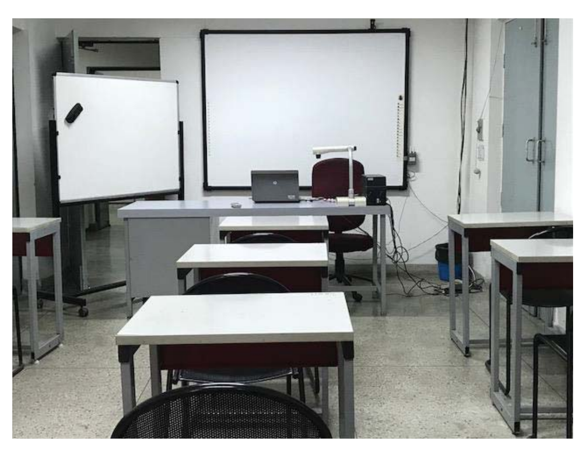
M.Sc. (Genetics) classroom with multimedia facility for interactive teaching