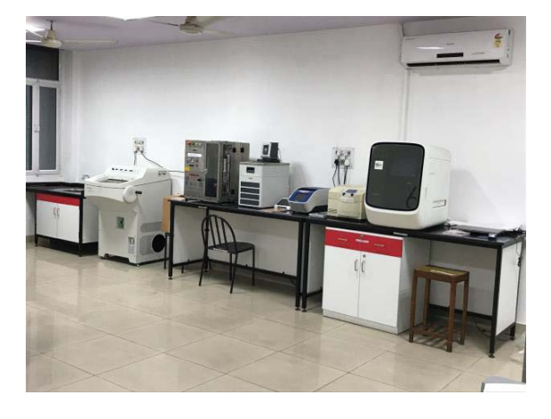
Real Time PCR